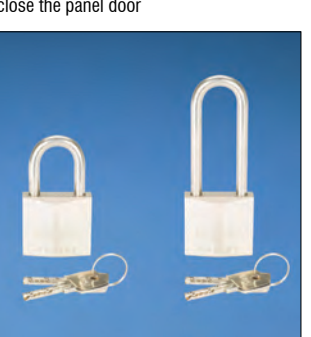
PSL-9 and PSL-9-LS

Harsh environment padlocks are created with a solid brass body with a chrome finish and stainless steel shackle for use in severe weather and environmental conditions. Flexible shackle padlocks allow movement of the lock body in order to close the panel door