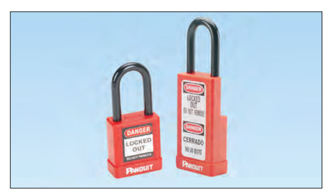
PSL-8 and PSL-8-LB

Aluminum body and shackle with non-conductive vinyl cover delivers protection against electrical hazards for maximum safety, specifically in lockout/tagout applications. Padlock is available with the standard 1.77" body or 3.00" long body design that allows safety message to be displayed on the padlocks in two languages.